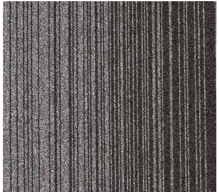
COBALT CREATIONS 6384251