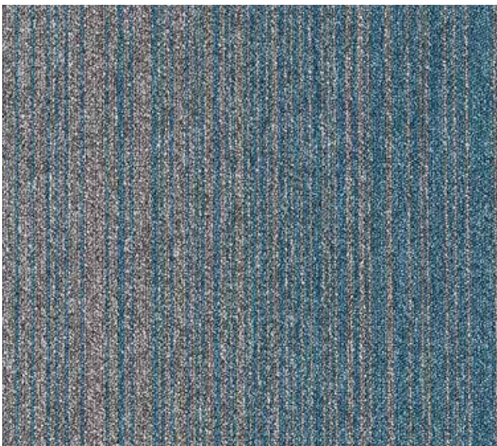
COBALT CREATIONS 6384263