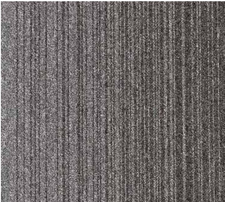
COBALT CREATIONS 6384250