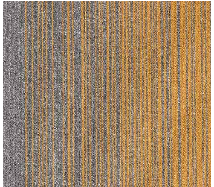
COBALT CREATIONS 6384249